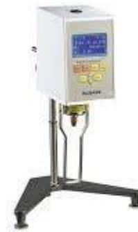
Fig 7: Viscometer

Viscosity was determined using the following formula Viscosity=Density of test liquid*time required to flow test liquid/Density of water *time required to flow water=viscosity of water.