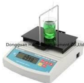
Fig 5: Density meter

It was evaluated by given formula, Formula for density: Density of liquid under test (syrup) =weight of the liquid under test/volume of liquid under test (w3/v).