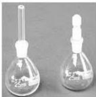
Fig 6: Specific gravity by pycnometer

Specific gravity of liquid under Test (syrup) = weight of liquid under test/weight of water=w5/w4.