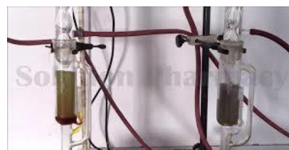
Fig 3: Soxhlet Extraction Process

100gm of healthy vinca leaves are collected from the fresh vinca plant. Dried in the air for 3days and powdered them, after that 60gm of powder is obtained. The extract was prepared with an ethanol, extracted to obtain ethanol-specific active ingredients by the Soxhlet extraction method. Furthermore the extract was filtered, and the extracts of the quantities used as shown in the table was used to prepare formulation on the laboratory scale, this are further mixed with invert syrup to obtain 80ml of medicated syrup of vinca extract. Suitable dyes, flavoring agents were added to it. This resulting syrup were added to an amber colored bottle, tightly closed and placed in a cool, dry place. Table 1 give the final formulation prepared on the laboratory Scale.