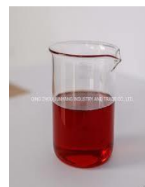
Fig 4: Obtained vinca extract

It is used in various herbal and Ayurveda treatment of cancer. The Soxhlet extracted alcoholic extract was obtained which was further filtered and used.