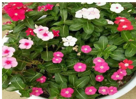
Fig 1: Vinca Plant

alkaloids are also important for fighting Cancer. They are main four Vinca alkaloids in Clinical use: vincristine, Vinorelbine, Vincristine and vindesine. These active constituents have been approved for use in the United States. Vinflunine is also a novel synthetic alkaloid from periwinkle, which have been approved in Europe for the treatment of second order transitional cell carcinoma of the ureter is the under development for other malignancy cancer. Vinca alkaloids are second most widely used class of cancer drugs and will remain one of the cancer therapy [3-4].