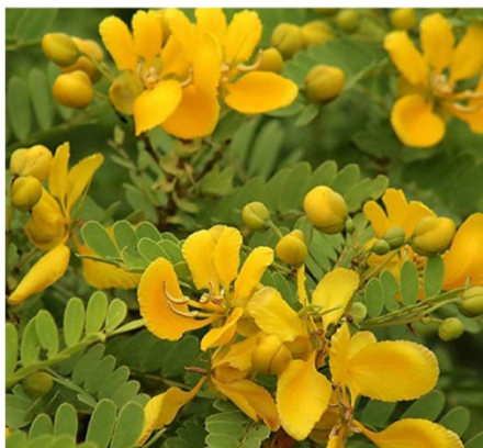
Fig .1 Cassia Auriculata

The plant's leaves are astringent, acrid, cooling, diuretic, bitter, ophthalmic, and vulnerary. The entire plant has medicinal significance from the tip to the root, demonstrating therapeutic properties like anti-microbial, anti-diabetics, hepatoprotective, antiperoxidative, antiviral, and antipyretic. A plant's bark is used to cure gout, gonorrhoea, and rheumatic pain, while the roots are significant in urinary disorders, fever, and other bacterial infections. Leaf properties include constipation and are helpful in digestion. Flower buds are used to treat diabetes [5].