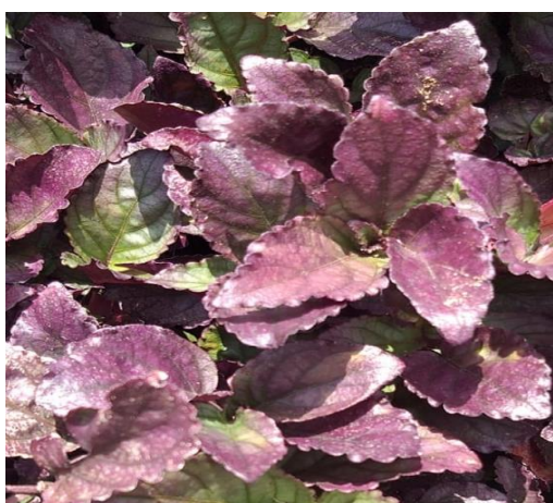
Figure- 1 H. colorata leaves

Hemigraphis colorata is a versatile and exotic perennial herb which grows to the height of 15-30cm. Its branches lie upon or just above the ground and spreads with rooting stems. Leaves (Figure-1) are greyish green in colour with a crimson purple stain on top and a darker purple underneath. These leaves are slender and lance shaped with toothed, scalloped or lobed margins with tiny white flowers its terminal spikes (Figure-2) [5]. The leaves are 4 to 8 cm long and shimmering silvery violet underneath red purple. This plant is adapted to India and is a native of Java [6].