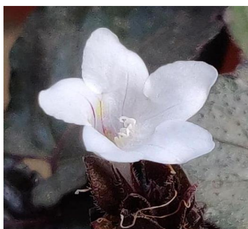
Figure-2 H. colorata flower